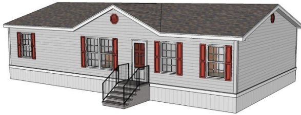
Double-Wide Mobile Home

Mobile Home: A trailer coach that may be used as a dwelling all year round; has water faucets and shower or other bathing facilities that may be connected to a water distribution system; has facilities for washing and a water closet or other similar facility that may be connected to a sewage system; and that conforms to the Canadian Standards Association Standard # Z240.