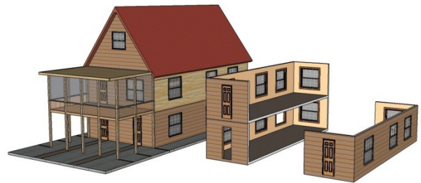
Modular (Manufactured) Home

Modular (Manufactured) Home: A residential dwelling that is constructed off site in a yard or factory, in one or more sections, transported to a site for permanent installation on a permanent foundation (may have a basement), having architectural features similar to permanent residential dwellings built on site in the Town, and conforming to Canadian Standards Association (CSA) Standard A277.