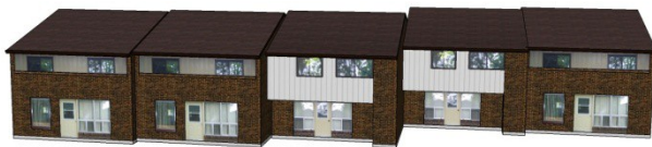
Town House Dwelling

Dwelling, Townhouse: A dwelling, designed as one cohesive building in terms of architectural design, which contains three (3) or more similar attached dwelling units each of which fronts on a street, has direct access to the outside at grade and is not wholly or partly above another dwelling.