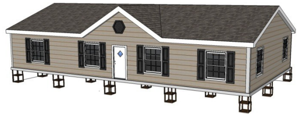
RTM (Ready to Move) Home

RTM (Ready to Move) Home: A residential dwelling that is constructed off-site in a yard or factory to National building code and transported as a single unit to a site for permanent installation on a permanent foundation including a basement.