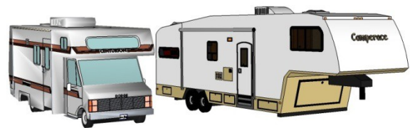
Motor Home – Camping Trailer

Trailer (Camping), Motor Home: Any vehicle designed, constructed or reconstructed in such a manner as will permit occupancy as a dwelling or sleeping place for one or more persons, notwithstanding that its running gear is removed or jacked up, is used or constructed in such a way as to enable it to be used as a conveyance upon public streets or highways, and includes self-propelled and non-self-propelled vehicles.